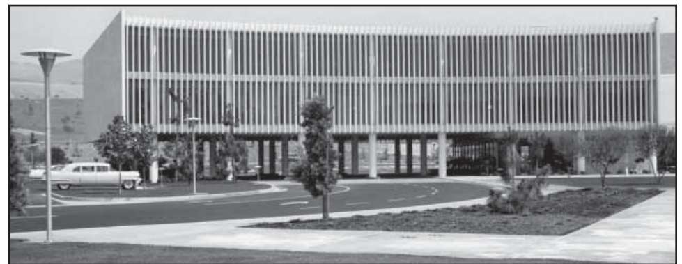
In its original form, The Mortuary at Rose Hills had only 2 levels.

The Mortuary opened in 1956, distinguishing Rose Hills as the second "combination" memorial property in California, offering both funeral and cemetery services. Today, it serves more families annually than any other mortuary in the world. The modern staterooms are designed to anticipate families' needs. Some rooms are specially outfitted to honor certain cultural practices and customs.