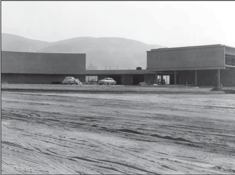
September 28, 1955

The building bordering the parking lot is the Rose Hills Administration Building. At the edge of this building that is closest to the parking lot entry, you will notice a walkway leading toward a small rose garden. Take this path and the first available door on your right is the Galleria.